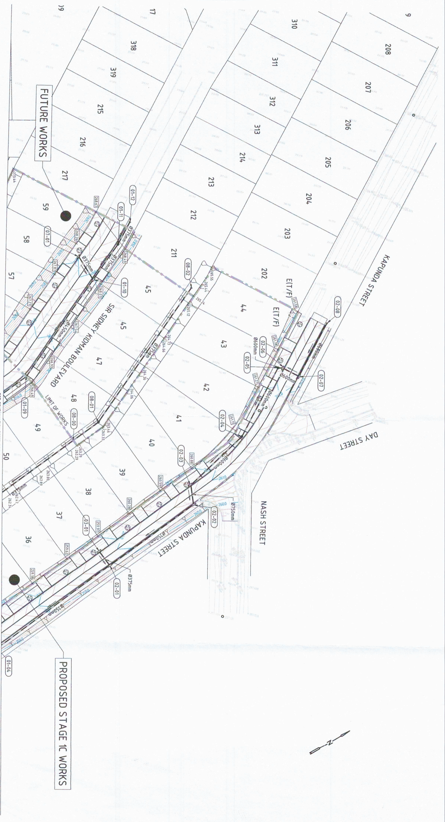
LAYOUT VIEW-2 SCALE 1:500 FOR CONTINUATION REFER DRG C71